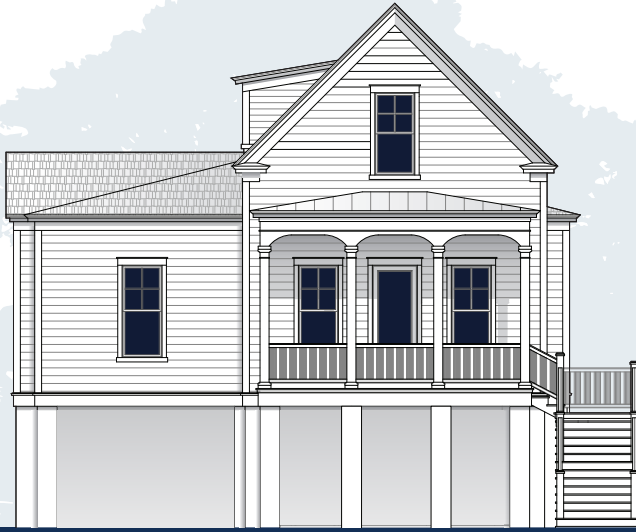
Norfleet Shores Road