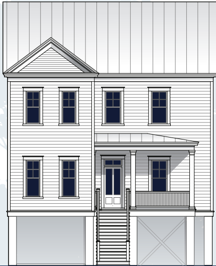
Norfleet Shores Road